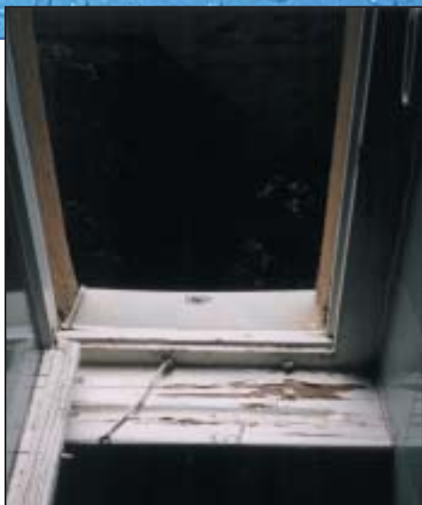
Leaky window – mold is beginning to rot the wooden frame and windowsill.

If you already have a mold problem – ACT QUICKLY. Mold damages what it grows on. The longer it grows, the more damage it can cause.