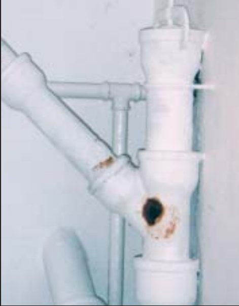
Rust is an indicator that condensation occurs on this drainpipe. The pipe should be insulated to prevent condensation.

Renters: Report all plumbing leaks and moisture problems immediately to your building owner, manager, or superintendent. In cases where persistent water problems are not addressed, you may want to contact local, state, or federal health or housing authorities.